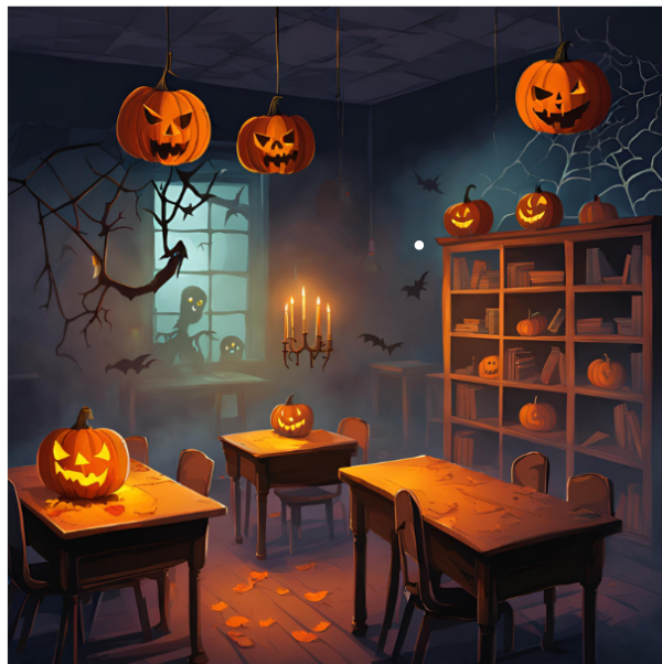
*This image was created using generative AI!

Have you heard of a little thing called “artificial intelligence”? Generative AI is growing exponentially and educators are trying to decide its purpose, advantages, and disadvantages in the classroom. The CITL has composed several resources on how to utilize and integrate AI in education .